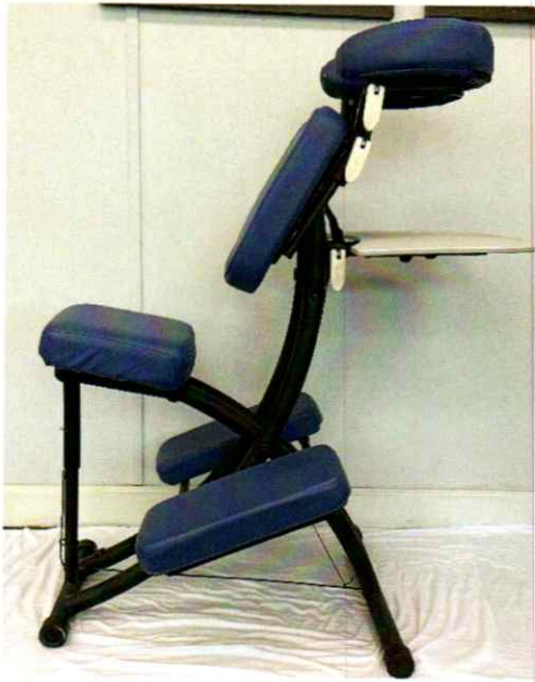
Seated Support with Work Desk (pictured 100% setup)