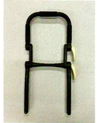
Quick Lock (2)