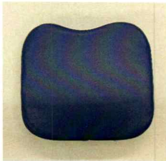
Small Chest Pad