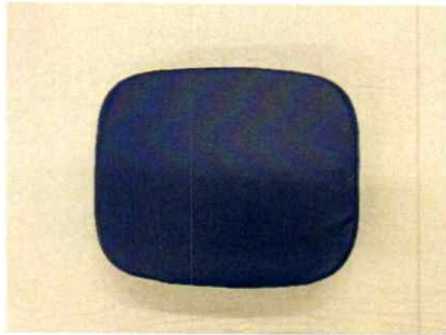
Large Chest Pad