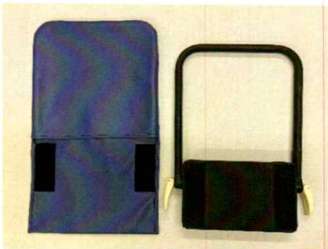
Yoke Base with Cover