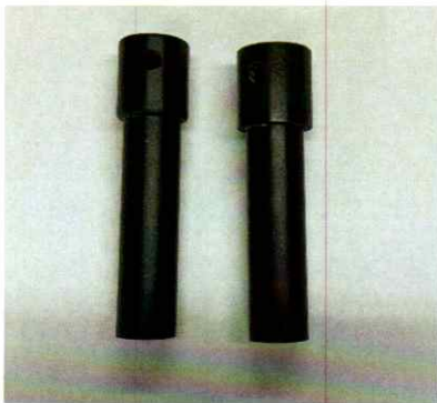
Extenders (for U-Bar)